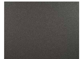
Shadow Gray (TSG)