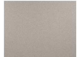
Ash Gray (TAG)