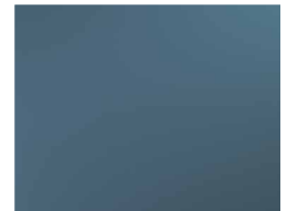
Slate Blue (SB)

Please note that oil canning in the flat of the panel and where it is fastened is common and not a reason for rejection. Oil canning is less noticeable in textured colors.