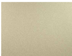
Light Stone (TLS)