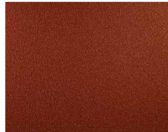
Colonial Red (TCR)