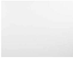
Bright White (WH)