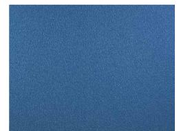
Gallery Blue (TGB)