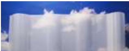
SOFT WHITE - 85% LIGHT TRANSMISSION