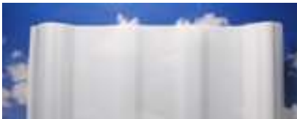
WHITE (OPAL) - 45% LIGHT TRANSMISSION