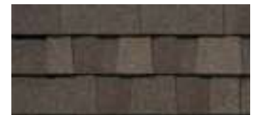
WEATHERED WOOD (WW)