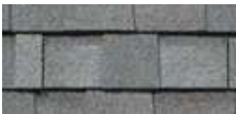
OLDE ENGLISH PEWTER (PG)