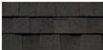
RUSTIC BLACK (RB)